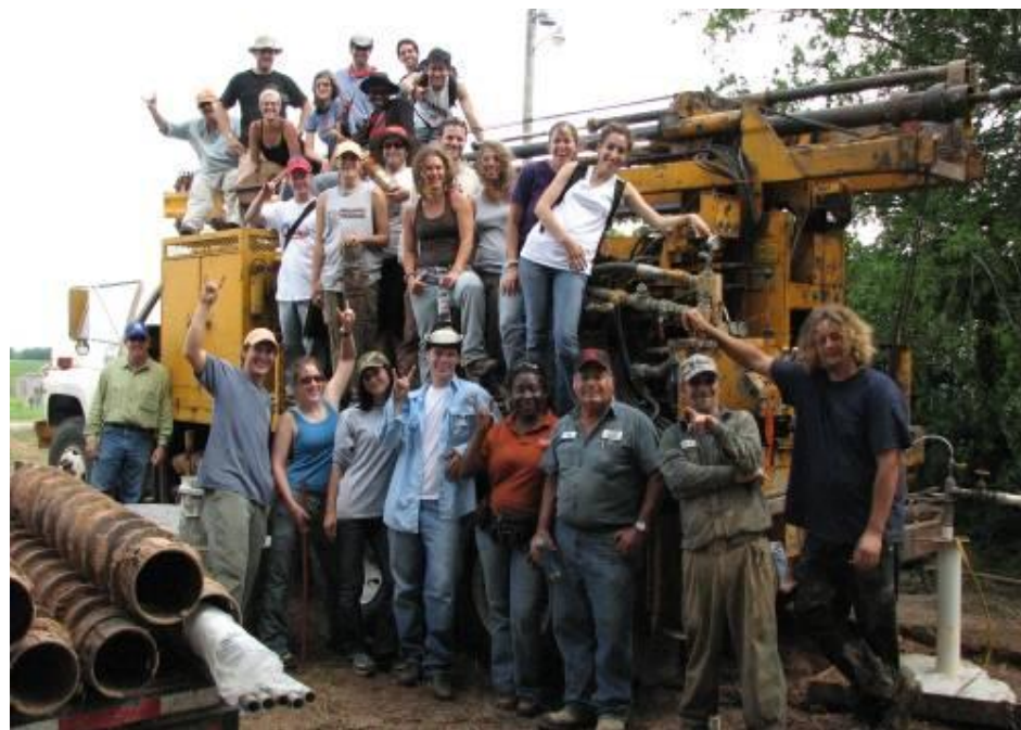
Group from UT Austin installing wells at Hornsby Bend.