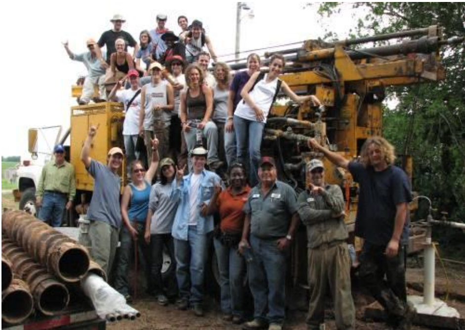
Group from UT Austin installing wells at Hornsby Bend.