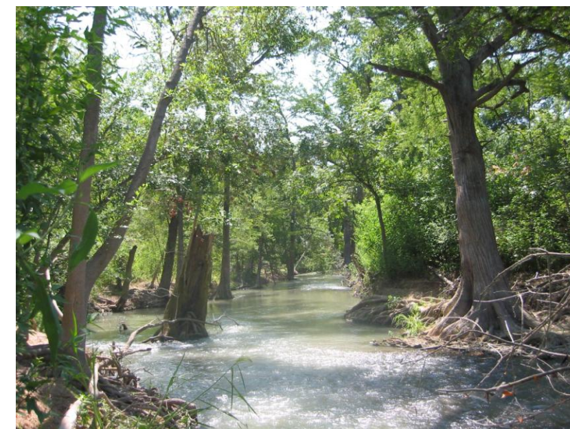
The Medina River in West Texas