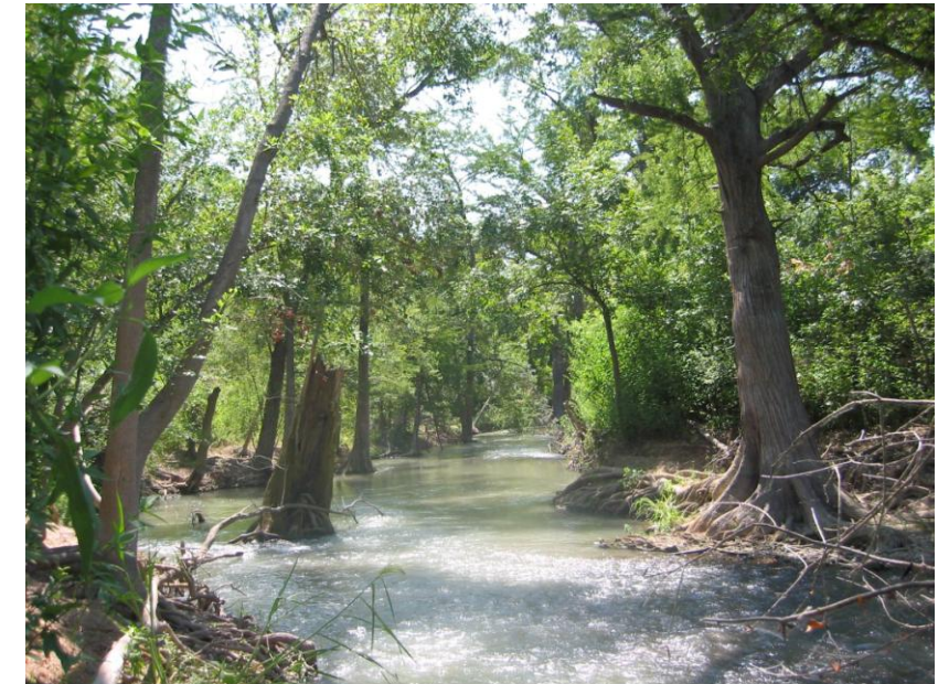
The Medina River in West Texas