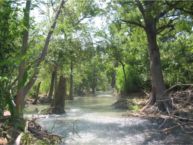
The Medina River in West Texas