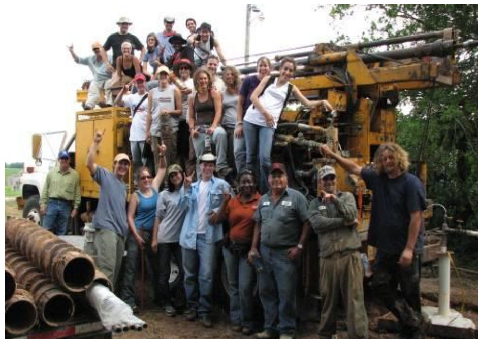
Group from UT Austin installing wells at Hornsby Bend.